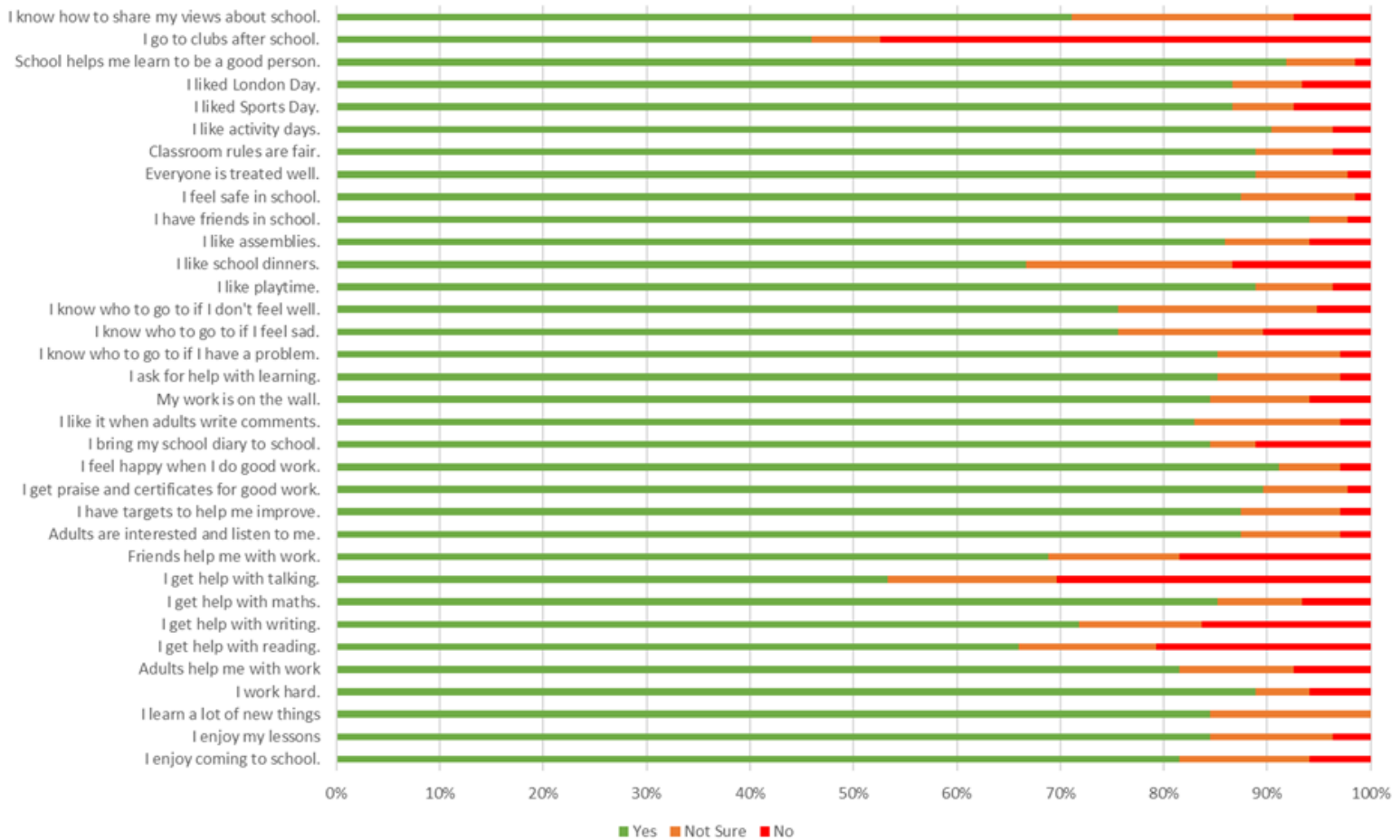
Pupil Questionnaire results, 2022

It is clear that the majority of the responses were positive with pupils agreeing with the statements (green).