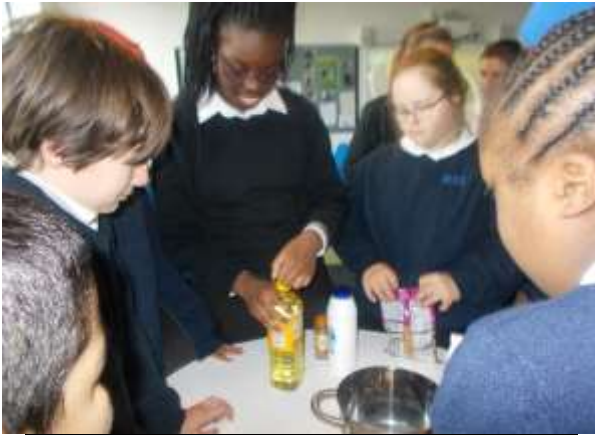
Making the product - Following instructions