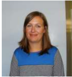
Work Experience Coordinator

We know that pupils learn how to use what they know and show their skills best through practical tasks in a realistic vocational environment.