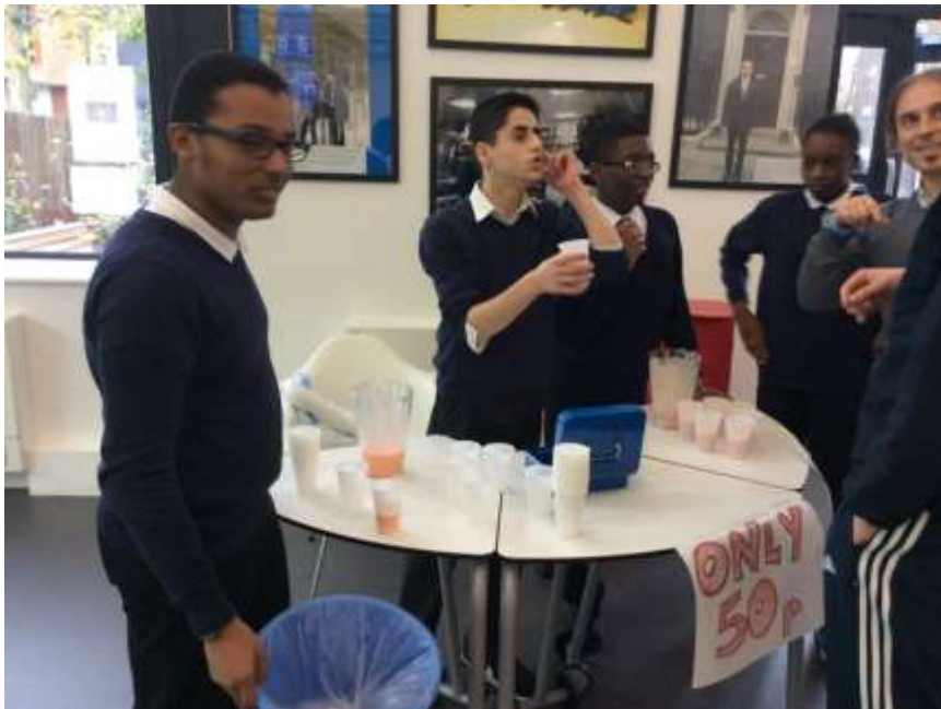
Making and selling the product