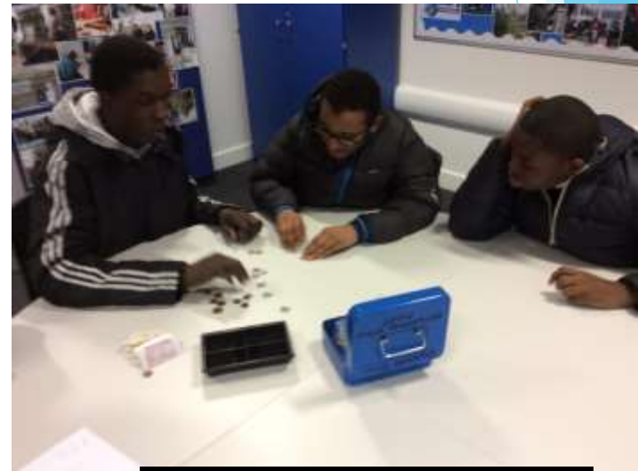
Counting the profits!