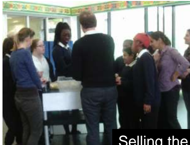
Selling the product – Communication & money