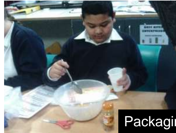
Packaging the product – measuring