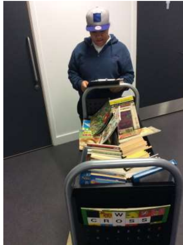
Visiting classes each day