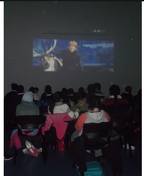
A packed activity studio of pupils watching Frozen at our first Cinema Club