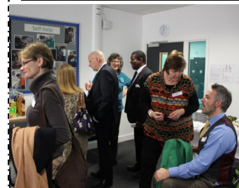
Highshore School Business Link Lunch