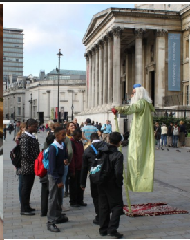
Year 8s' visit To the National Gallery & Trafalgar Square.