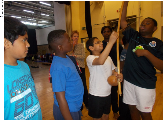
Class 7E pupils preparing for archery