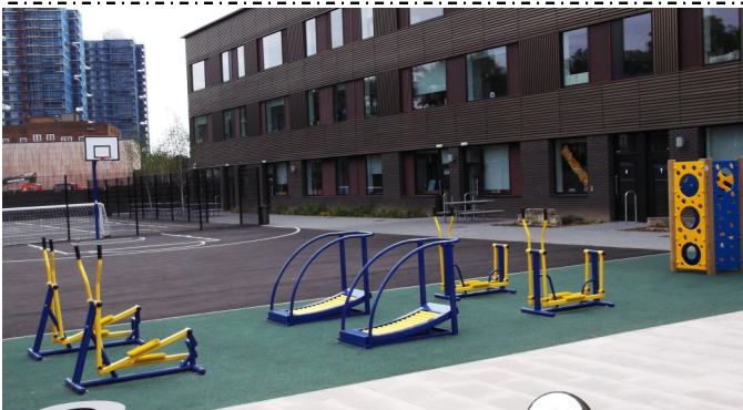
The children are enjoying the new playground and it's equipment!